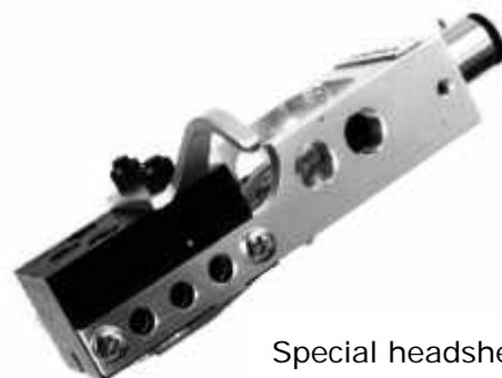
Special headshell for Nova